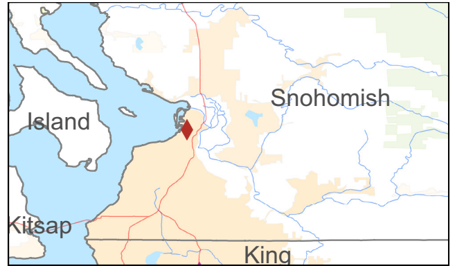
◆ Cascade Birth Center