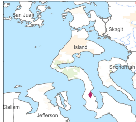
◆ Greenbank Birth Center