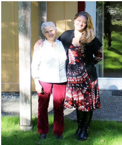
Whidbey Record, Tue Oct 11th, 2016