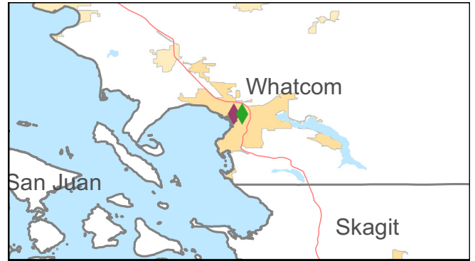
◆ Birthroot Birth Center ◆ Bellingham Birth Center