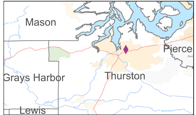
◆ The Birth House