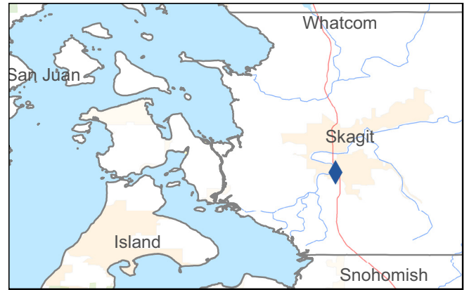
◆ Mount Vernon Birth Center