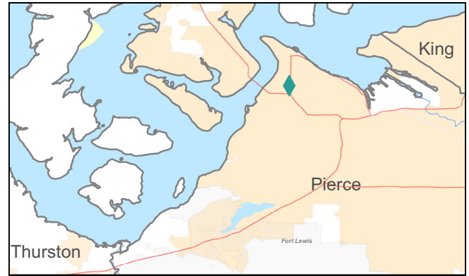
◆ The Birthing Inn