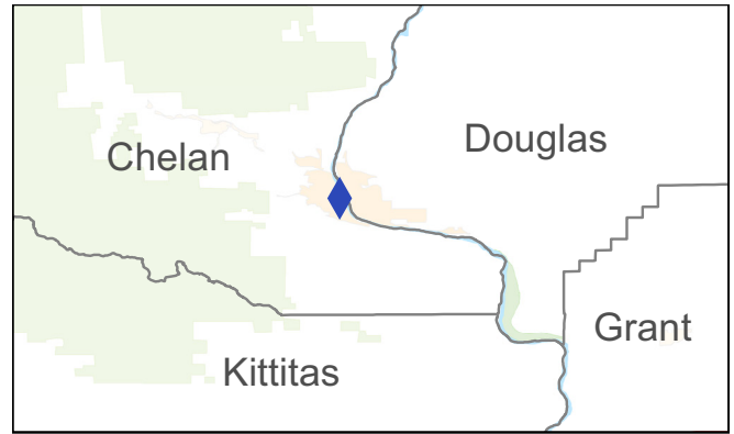
◆ Wenatchee Childbirth Center